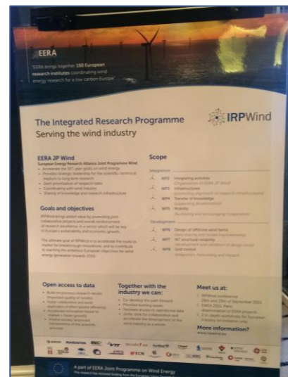
... IRPWind present with a poster