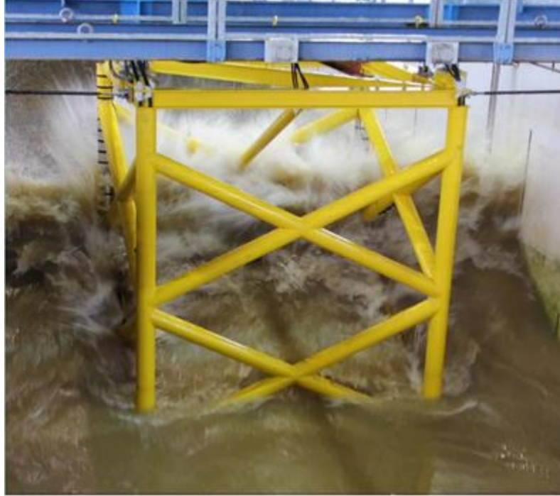
Excerpt of measurement campaigns that have been uploaded: Hybrid testing of a semisubmersible scaled wind turbine (top left), wave slam tests on a jacket-structure