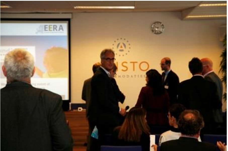
Participants at the IRPWind Annual Conference 2016, Amsterdam.