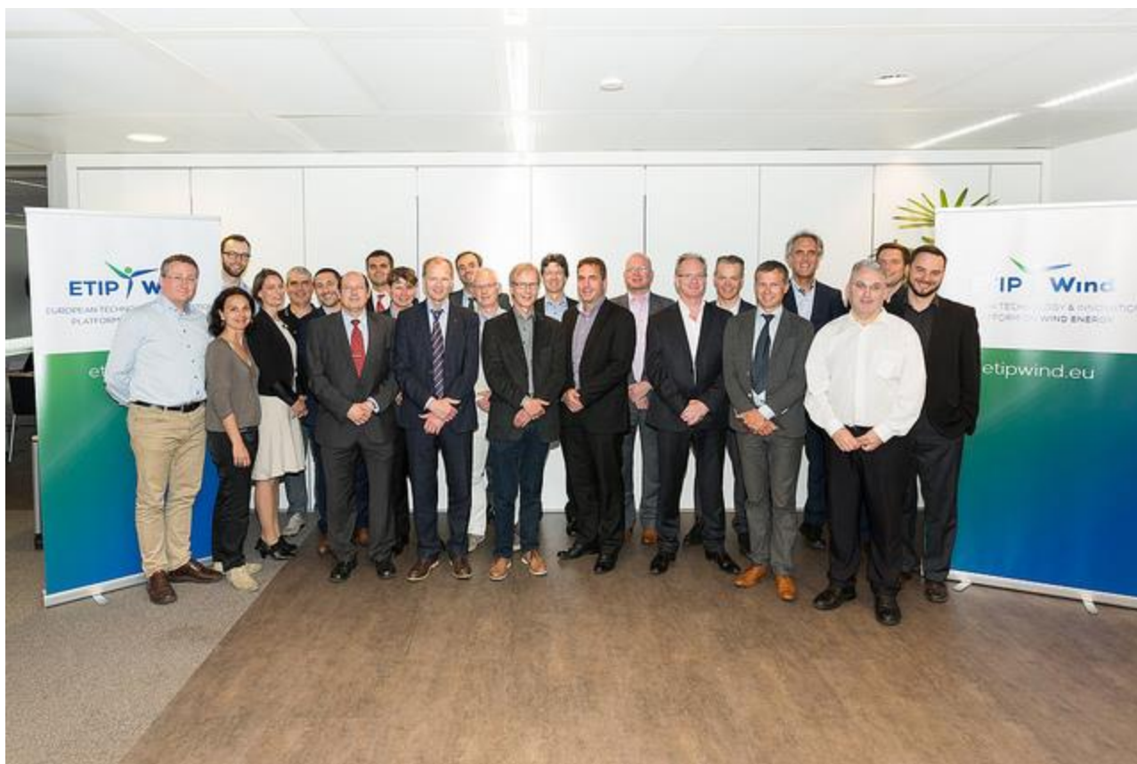
Group picture, ETIPWind representatives in Brussels

On Friday 3 June a validation meeting took place in Brussels, where the results of this gap analysis were presented to the wind energy community. A discussion on which research priorities should be in the 2016 Strategic Research Agenda took place. The consolidated paper is being approved by the ETIPWind Steering Committee and will be available on the ETIPWind website in mid-July.